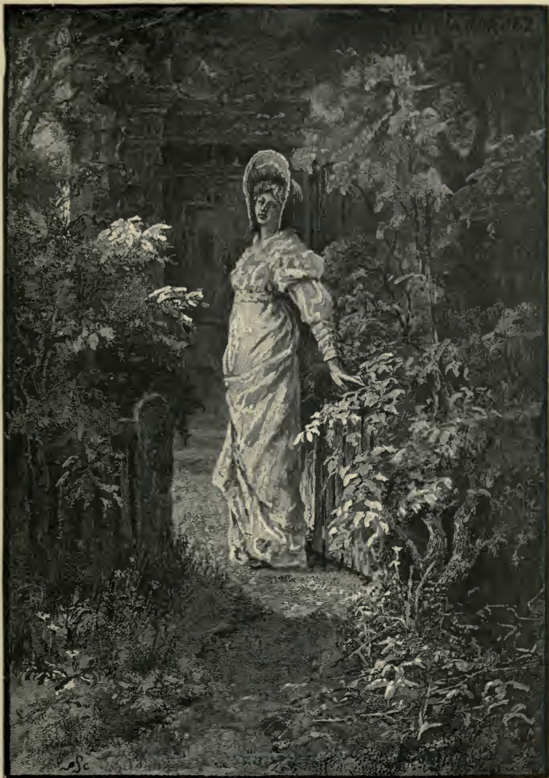
"THE QUEEN'S RIDE." Page 22.